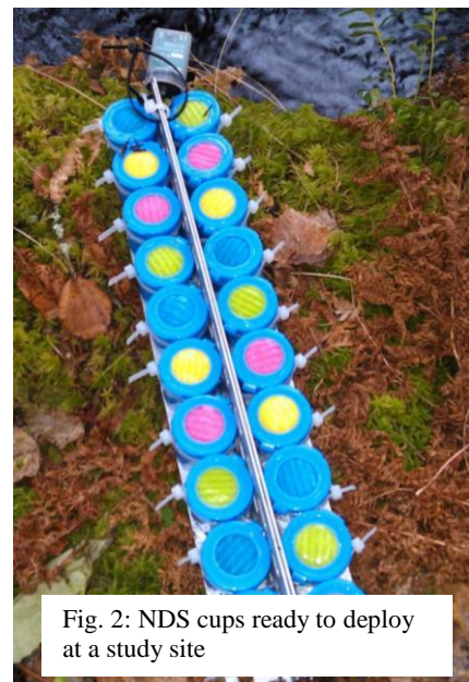
Fig. 2: NDS cups ready to deploy at a study site

Heterotrophic biofilms, composed of bacteria and fungi developing on rocks, leaves, and wood play critical roles in the ecology and biogeochemistry of stream ecosystems everywhere. There are very few studies of the factors that drive biofilm activity in boreal streams, however, and basic information regarding nutrient limitation and the potential role(s) of landscape structure and vegetation cover remain poorly understood. In the autumn of 2013, we deployed nutrient diffusing substrata (NDS; Fig. 2) to measure the activity associated with stream biofilm communities across the gradient of study sites described above ( n = 20 sites). Briefly, NDS are constructed using small plastic cups filled with agar that includes nitrogen (N), phosphorus (P), nitrogen and phosphorus in combination (NP), or nothing (as a control). Organic substrate (cellulose) is affixed to the surface of the cups and they are placed in the stream for two weeks, during which nutrients diffuse out of the agar and enrich the biofilm community growing on the overlying cellulose.