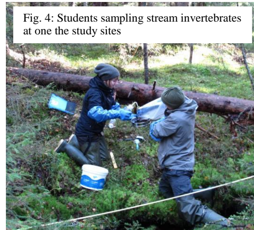
Fig. 4: Students sampling stream invertebrates at one the study sites

Overall, results suggest that forest clear-felling and recovery may induce changes in the composition and biodiversity of macroinvertebrate communities, but that other aspects of stream habitat and landscape structure are important as well. More specifically, preliminary results indicate significant positive correlations between taxonomic richness and water depth (Spearman r = +0.62 , p = 0.005 , n = 18 ) and catchment area ( r = +0.69 , p = 0.001 ), indicating that even small changes in stream size influence local community composition. In addition, several physical and chemical habitat variables were correlated with variation in taxonomic richness among sites, including average substrate size ( r = +0.53 , p = 0.02 ) and pH ( r = +0.60 , p = 0.007 ), which are both key variables known to influence the structure of stream communities.